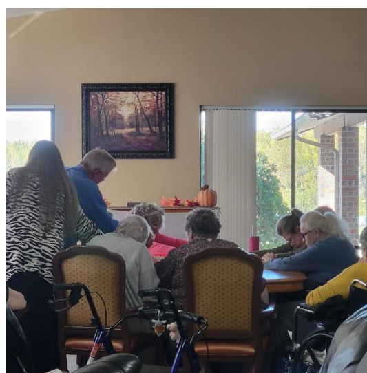
Prayer at Hermitage